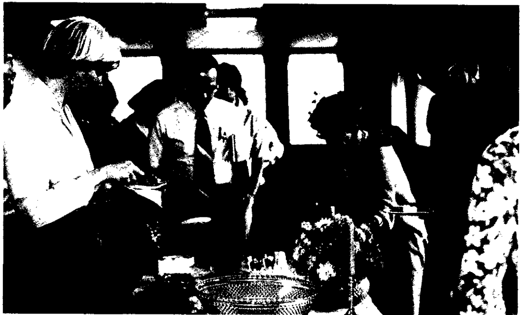
A candid shot taken at InULA's annual business meeting, June 5, 1984.

Designed/Printed by Western Sun Printing Co. Inc., Bloomington, Indiana 47401.